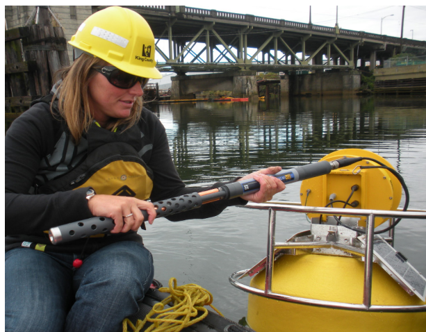
EMM68 Buoy supports a single water quality instrument, such as a YSI EXO or 6600 V2-4 Sonde, positioned inside the subsurface pipe

Contact YSI's Integrated Systems & Services division to discuss your specific monitoring application. We offer a variety of buoy platforms which can be tailored to fit your needs. Our other systems are suited for deployment in high-energy environments and for long-term monitoring projects