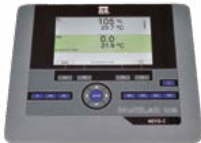
MultiLab 4010-2 Dual channel