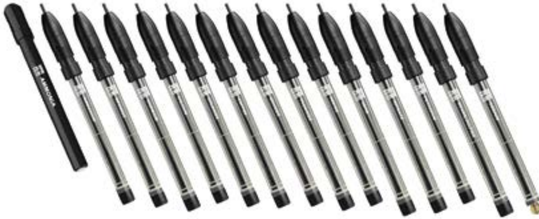
TruLine Family of ISEs

Ammonia Ammonium Bromide Cadmium Calcium Chloride Copper Cyanide Fluoride Iodide Lead Nitrate Potassium Silver/Sulfide Sodium