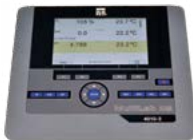
MultiLab 4010-3 Three channel